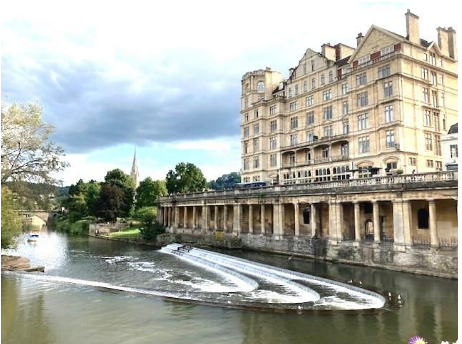
Bath Pulteney Weir