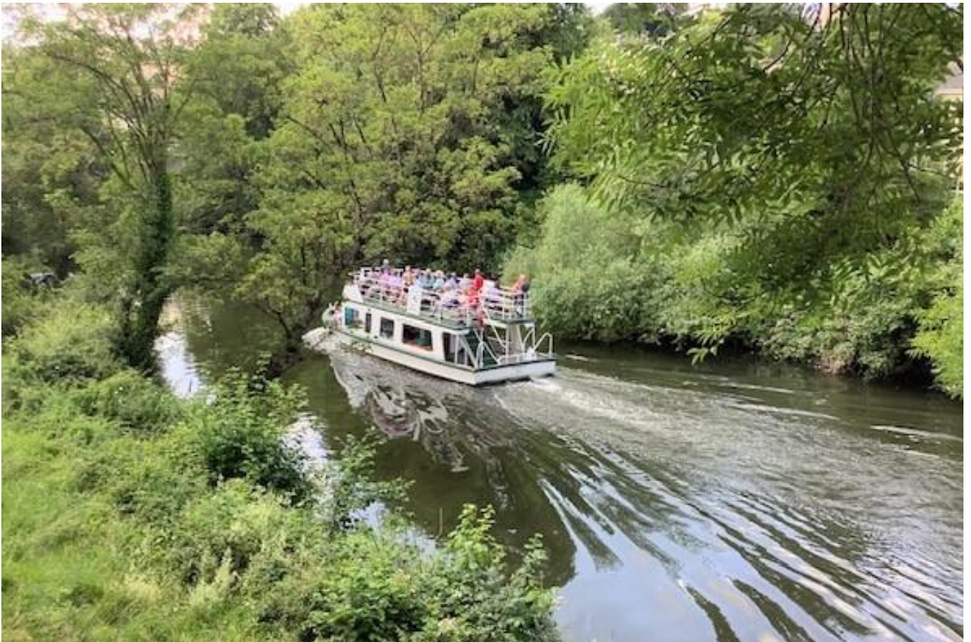
Boat Trip Passing by Bridgemead