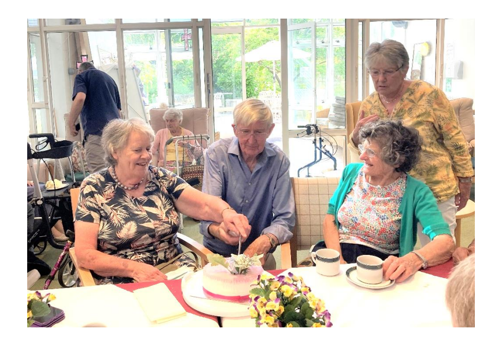
FRIENDS OF BRIDGEMEAD